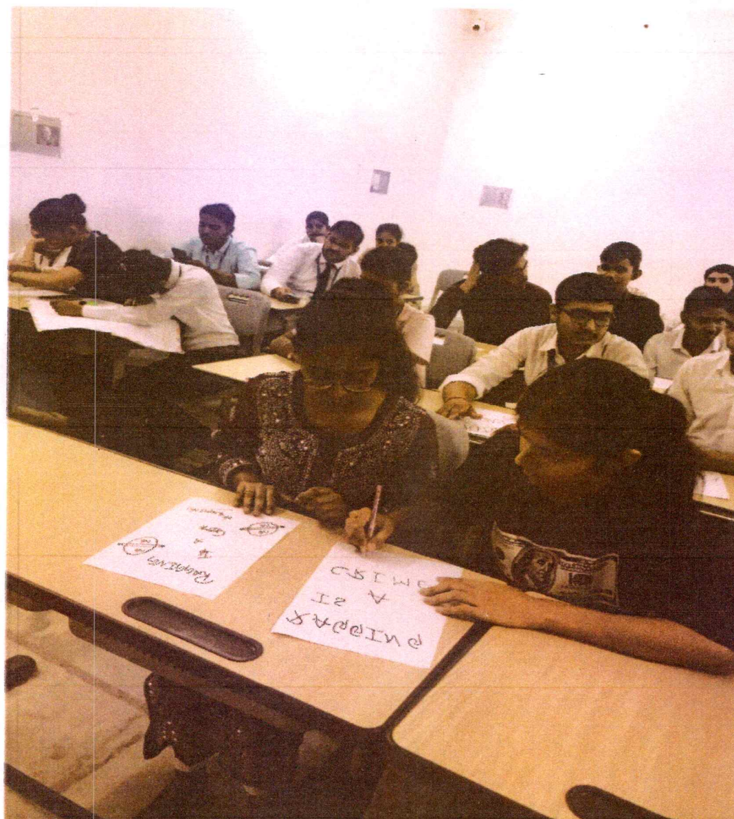
Fig.2 ("Anti Ragging Awareness Program")

(Established U/S 2(f) of UGC Act, 1956 vide Act No. F.2(5) Vidhi/2/2009 of 5-2-2009, Govt. of Rajasthan)