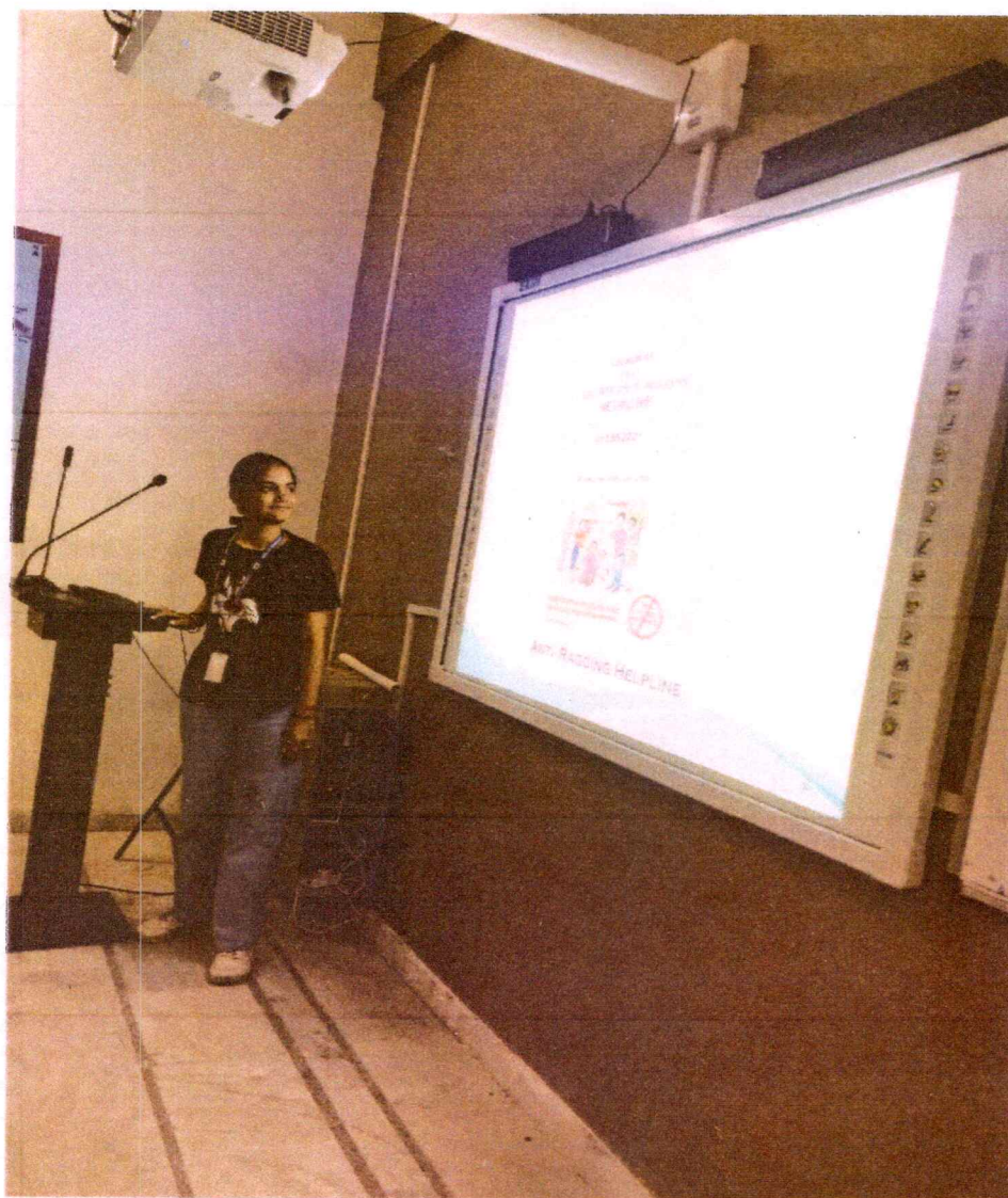
Fig.1 ("Anti Ragging Awareness Program")

(Established U/S 2(f) of UGC Act, 1956 vide Act No. F.2(5) Vidhi/2/2009 of 5-2-2009, Govt. of Rajasthan)