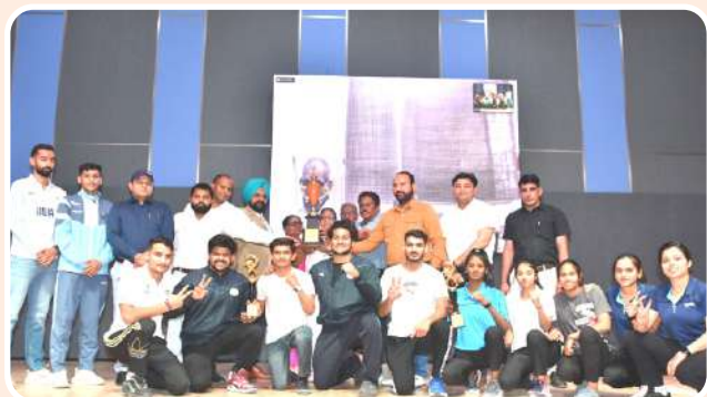
All India Inter University Qwan Ki Do (M & W) Championship, 2023-24 University Team with Winner Trophy