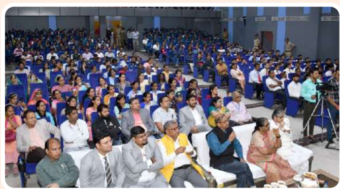
Auditorium Inside View