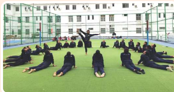
Yoga activities by the students of Department of Yoga and Naturopathy