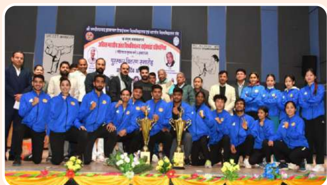
All India Inter University Taekwondo (M & W) Championship, 2023-24 University Team with Winner Trophy