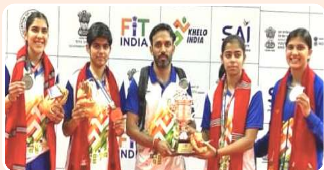
University Badminton Women Team at Khelo India University Games, 2023-24 with Runner Up Trophy