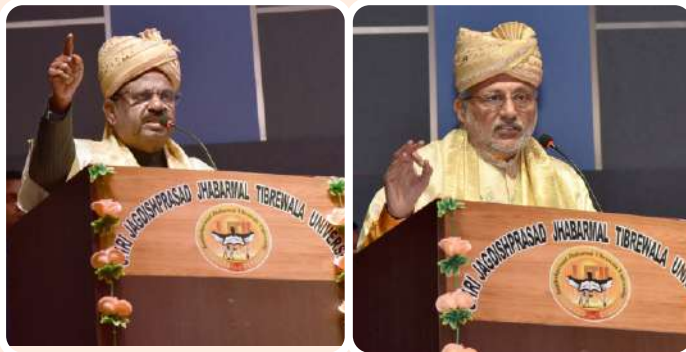
Hon'ble Dr. CV Ananda Bose, Governor, West Bengal and Hon'ble Sh. CP Radhakrishnan, Governor, Jharkhand addressed JJTians on 12th Convocation of the University on 13 February, 2024.