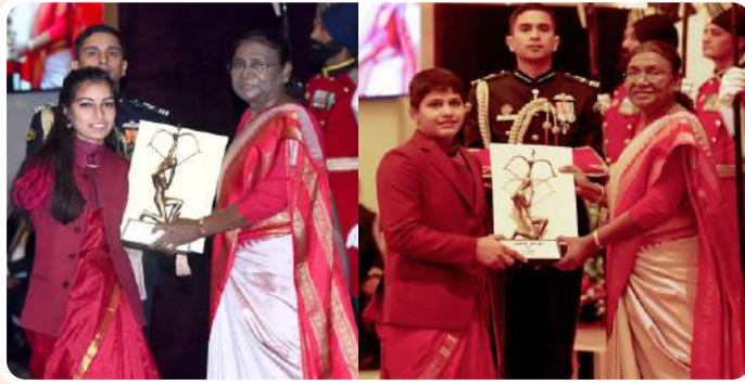
SJJTU student & Country's Youngest Arjun Awardee, First international para-archer Sheetal Devi and Young Wrestler Antim Panghal conferred with Arjun Award by Hon'ble President of India Smt. Draupdi Murmu.