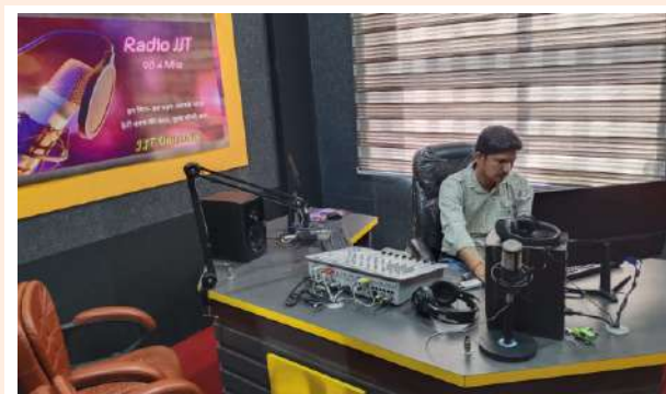
JJTU Community Radio Station 90.4 MHZ