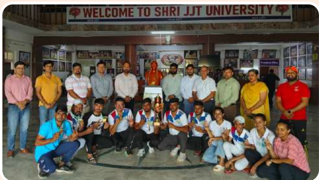
All India Inter University Drop Roball (M & W) Championship, 2023-24 University Team with Winner Trophy