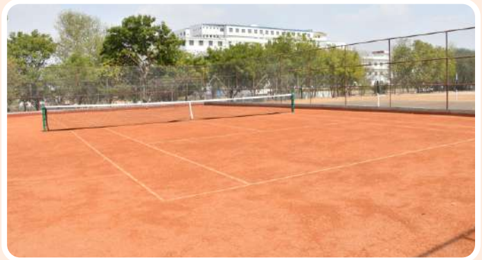
Lawn Tennis Clay Court