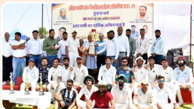
All India Inter University Cricket (Men) Tournament, 2023-24 University Team with Winner Trophy