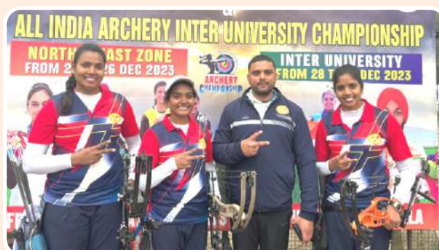
All India Inter University Archery (Women) Championship, 2023-24 University Winner Team