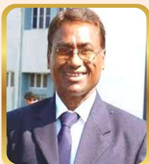
Shri Ashok Dhyanchand Olympic Gold Medalist (Hockey)