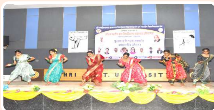
Performance of Rajasthani Folk Dance by talented students of the University