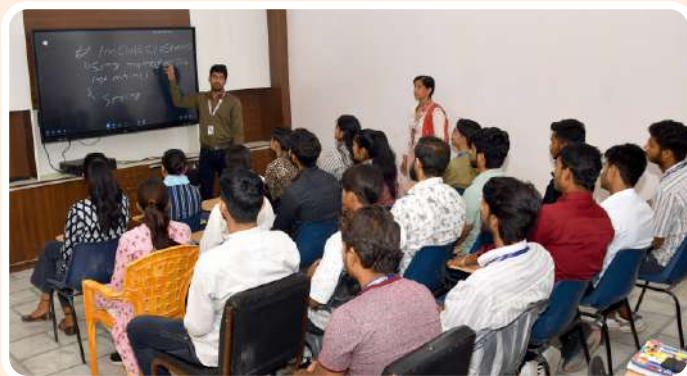
Smart Class Room