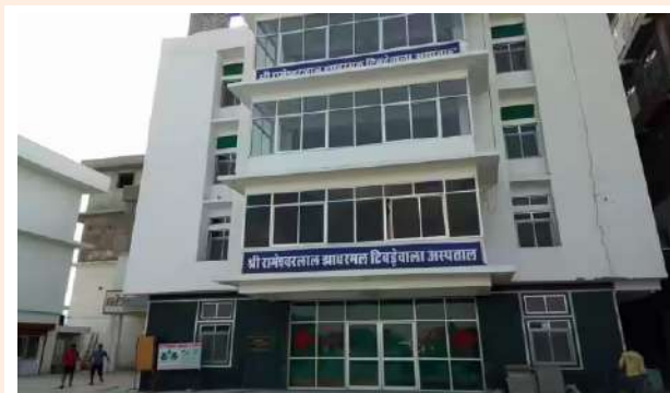
24 x 7 Medical Facility RLJT Hospital