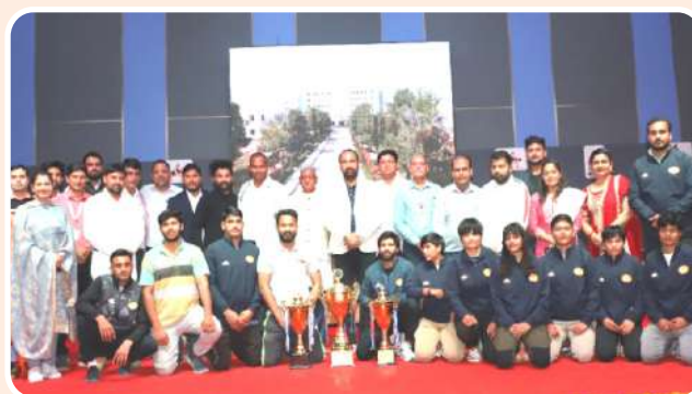
All India Inter University Grappling (M & W) Championship, 2023-24 University Team with Winner Trophy